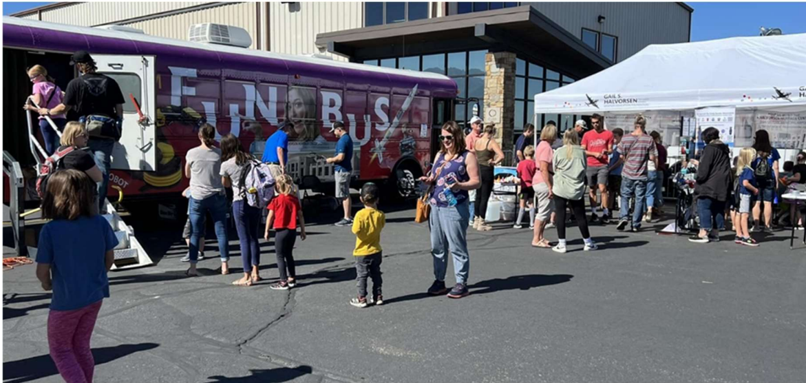
Children and parents line up to tour the STEM Fun Bus at the Spanish Fork Airport