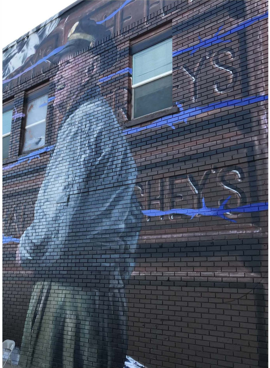
The Candy Bomber Mural in Tremonton, Utah

- Col. Gail S. Halvorsen The Berlin Candy Bomber