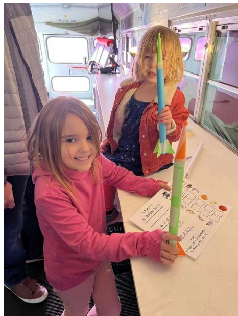
Girls making rockets in the Halvorsen STEM Fun Bus at the Sanpete Fall STEM Festival

We took to the road again on November 12 th to participate in the first-ever Sanpete Fall STEM Festival hosted by Snow College in Ephraim, Utah. This festival was part of the Utah Week of STEM program. The STEM Bus was front and center with 'build a straw rocket and launch it' project. We also gave a series of presentations on Gail Halvorsen the rocket scientist. The hosts were excited to have us come to Ephraim. They want a return visit in the Spring...and Summer, too. There were 1,000 children there- some traveled nearly 200 miles to participate.