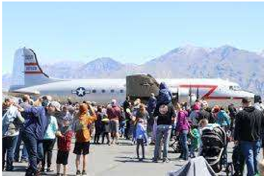
C-54 “Spirit of Freedom II” at Spanish Fork Airport

May 2022: To honor Gail’s life, the Foundation partnered with Airlift/Tanker Association, Berlin Airlift Historical Foundation, Civil Air Patrol, and the US Air Force to organize the Candy Bomber Celebration of Life: Celebrate-Inspire-Challenge. With support of donors, we held a four-day event featuring school tours of historic aircraft, a naming ceremony of a USAF C-17 Globemaster aircraft as “The Spirit of the Candy Bomber”, a community open house featuring STEM-themed displays and activities plus a commemorative candy drop using the C-54 “Spirit of Freedom Aircraft II”. Friends, family, foundation members, donors and other honored guests gathered at the new Provo Airport Terminal for a gala dinner on Friday evening, May 20 th to celebrate Gail's life and legacy. Gail's grandson and great-grand daughter shared messages and memories from people the world over whose lives have been impacted by Gail, including some of his Berlin Kids from the 1948-49 Berlin Airlift and military members. In all, we reached over 6,000 people during the event- 4,000 of which were children.